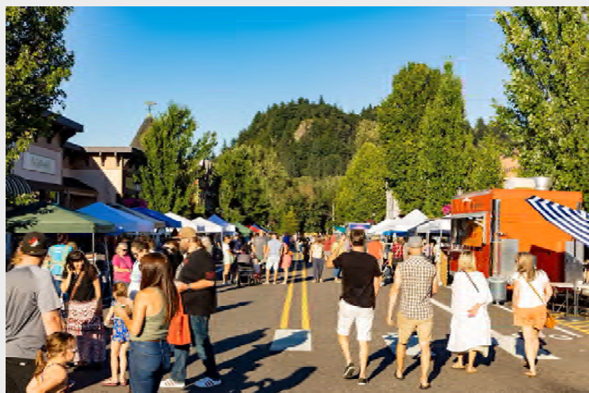
Top left: A young chess player ponders her next move at The Kids Zone during First Friday festivities. Above: Another beautiful Troutdale evening at First Friday. Below: Troutdale Arts Festival features fine art, music, wine, food - and crafts and face painting for the kids!