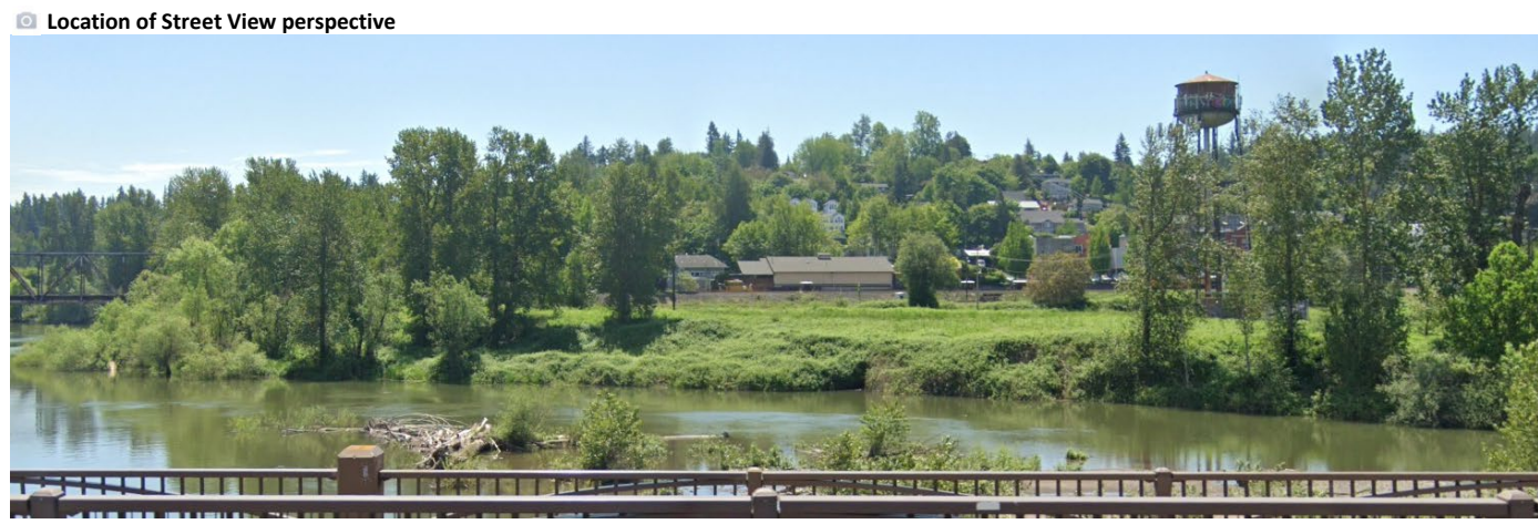
STREET VIEW

View of the Subject Property looking south from East I-84.