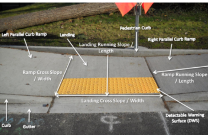
Parallel Curb Ramp